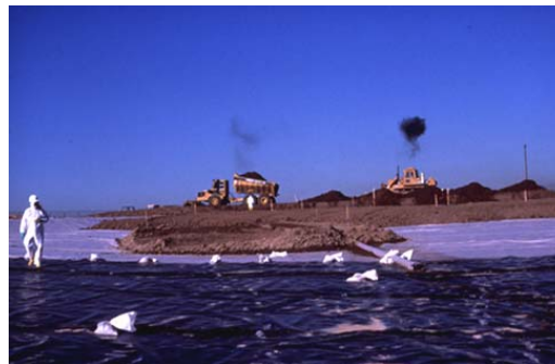
Clean up at the Rocky Mountain Arsenal

Michael Skinner, P.E. will be giving a presentation on groundwater contamination at this month's meeting. This informative presentation will cover topics including petroleum hydrocarbon contamination, volatile organic compound contamination, evaluating and mitigating the health risks associated with subsurface vapor intrusion into existing structures and some interesting local case histories including the Rocky Mountain Arsenal.